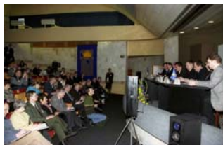
The press conference at the Norwecom fair.

Joint information project of the Stockholm Region Office in St. Petersburg and Restec exhibition company is being successfully developed. It is aimed at the information support of projects and events involving potential for cooperation between Stockholm-Mälars Region and the Northwest Russia. The project was presented at the Norwecom fair on 24 February. Russian participants of the trade fairs arranged by Restec are offered an opportunity to place the information in the Northwest Russia: Facts and Events electronic newsletter. The corresponding information is available, in particular, at the