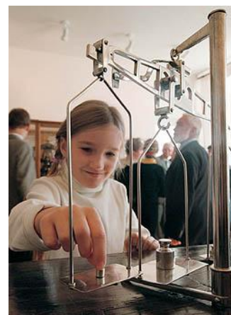
at the Museum of the Test and Certification Center