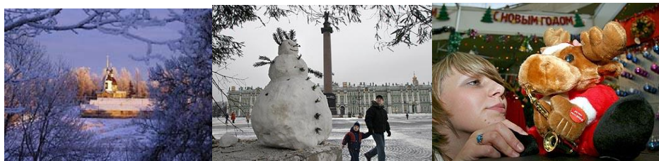
Photo: Bonch-Bruевич State St. Petersburg University of Telecommunications

Source: Stockholm Region Office in St. Petersburg, stockholm.office@stockholm.spb.ru